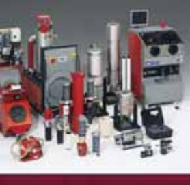
Prospekt: Filter systems DEF 7.929