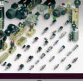
Pro.: Compact-Hydraulik DEF 5.300