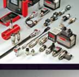
Prospekt: Elektronik DEF 18.000