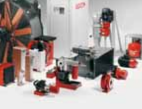
Prospekt: Kühlsysteme DEF 5.700