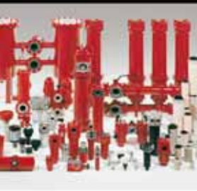
Prospekt: Filtertechnik DEF 7.000