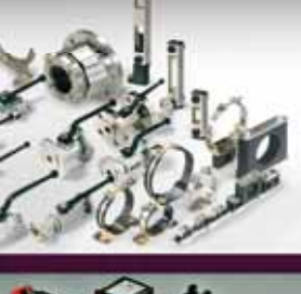
Prospekt: Accessories DEF 6.100