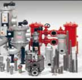
Pro.: Verfahrenstechnik DEF 7.700