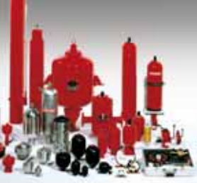
Pro.: Speicherteknik DEF 3.000